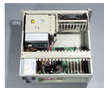
Motherboard can fit in 450 mm (17.7") depth