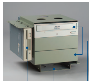
One 3.5" drive bay Three 5.25" drive bays One internal 3.5" drive bay space